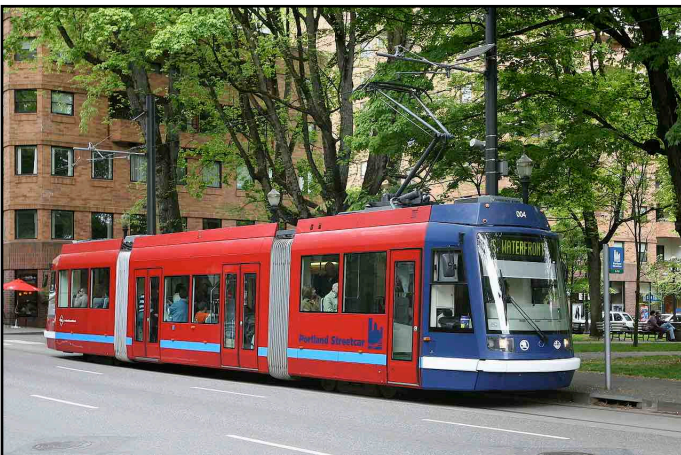
Portland streetcar eastbound at Portland State Univ. stop at Market St. and the South Park Blocks.

In addition, there are legacy streetcar systems in the U.S. in Boston, Philadelphia, San Francisco, and New Orleans (St. Charles Avenue, the oldest continuously operating streetcar line in the world). Of these, Boston and Philadelphia are candidate for modernization with low-floor streetcars. In addition there are 22 cities in the U.S. now with LRT. This is indeed some revival! ■