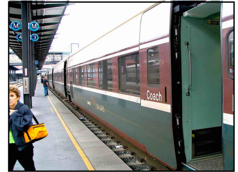
Amtrak Talgo Cascade at King Street Station, Seattle, July, 2005.

or sections seating up to 275 passengers. The cars of the train are lower and shorter than the standard passenger rail car. They are permanently coupled with one axle between each car. They offer an excellent ride on quality track. The Talgo trains may well be in service in Michigan in 2015. ■