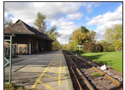
St. Marys VIA station - October , 2014