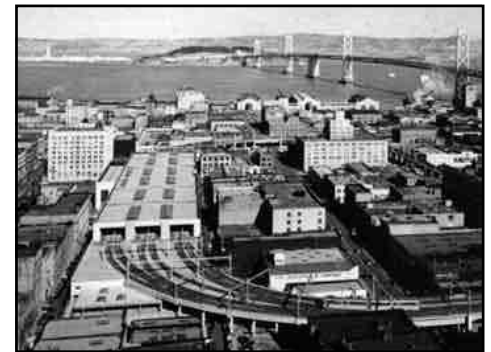
Above: Transbay Terminal circa 1939. Below: Rendering of 2019 Transbay Transit Center by Burohappold Engineering.

Fourth Street and King will remain a stop for Caltrain services. The City of San Francisco will extend its Third Street LRT line, opened in 2007, from 4th and King north in a tunnel with four stops to Chinatown. Construction of the 2.7km Central Subway began in 2012, will open in 2019, and will partly function as a downtown distributor for Caltrain commuters. ■