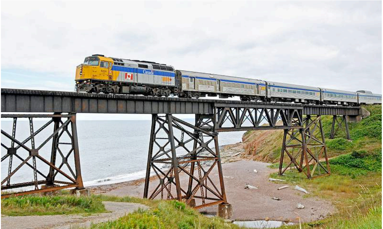
Rusting bridges, rotting ties and other infrastructure deterioration are disrupting VIA services nationwide, especially those operated over struggling short line railways in the Gaspé (above), northern Manitoba and on Vancouver Island (below). Public investment is required to maintain VIA service over these routes, two of which are already suspended.