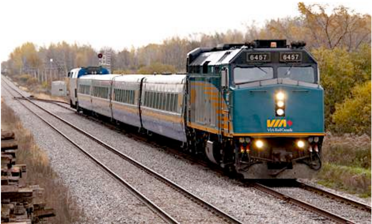
The use of two locomotives on either end of VIA's current corridor trainsets (top) and the leasing of push-pull bi-level commuter cars from the Michigan Department of Transportation are among the short-term options for improving VIA's corridor equipment utilization services pending the arrival of new equipment.